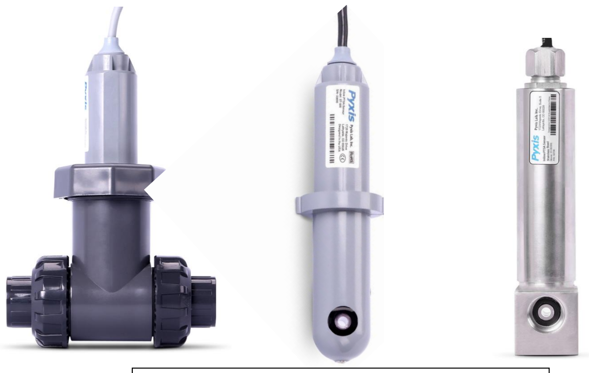
Figure 1 – ST-540A (UPVC) and ST-540SS (304-SS) Inline NDSA Fluorometers

The ST-540 Series offers Pyxis proprietary algorithms to determine the concentrations of NDSA in a range of 0-500ppb while simultaneously measuring light loss through the optical channel to determine sensor cleanliness. The ST-540 Series offer a combination of 4-20mA as well as RS-485 Modbus output signals and is Bluetooth Enabled for wireless cleanliness diagnostics and calibration when used with MA-WB or PowerPACK Series Bluetooth Adapters and the uPyxis APP for Mobile or Desktop devices. The ST-540 Series is provided in both UPVC and 304 stainless steel for use in a cooling/process water or cooled/pressurized sample (<120°F) of boiler water or boiler feedwater. Each sensor is provided with a 1.5m bulk-head cable with 7-Pin quick adapter and 1.5m flying lead cable with 7-Pin quick adapter, enabling rapid wiring to any microprocessor controller, PLC or DCS system. The MA-WB Bluetooth adapter may be inserted between ST-540 sensor cable and flying lead cable to enable wireless access for use with the uPyxis Mobile or Desktop APPs for diagnosis and calibration.