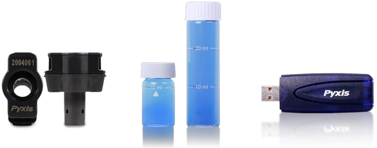
16mm COD Adapter

Each SP-910 comes equipped with one set of MA-24 (10mL) and MA-25 (25mL) sample vials, one 16-mm COD Vial Adapter (P/N 52214) and one MA-NEB Bluetooth USB Adapter.