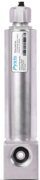
Figure 2 - ST-590SS