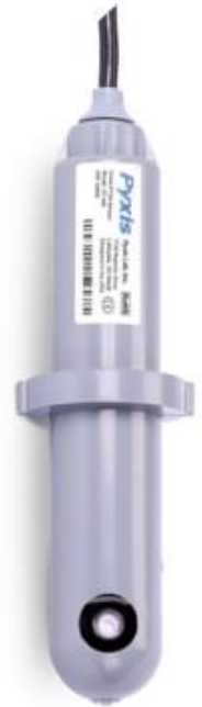
Figure 1 - ST-590

The ST-590 may be used as a stand-alone monitoring and control sensor for active polymer only or it may be used in conjunction with the Pyxis ST-500 inline PTSA sensor. Providing PTSA ( Total Chemical Dosed ) and Fluorescent Polymer ( Active Polymer Concentration ) measurement enables water treatment experts to “dial-in” the system performance to a level not previously attainable in the marketplace with conventional real-time methods. Through extensive research, Pyxis Lab has mastered this technology and embedded the coding necessary to compensate for color, turbidity and dual fluorophore overlap within the sensors themselves, enabling the user to instantly have “PTSA and Fluorescent Polymer” feed and control using any microprocessor controller, PLC or DCS.